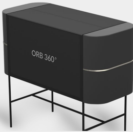
Accessories ORB unit