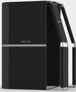
Model ORB unit